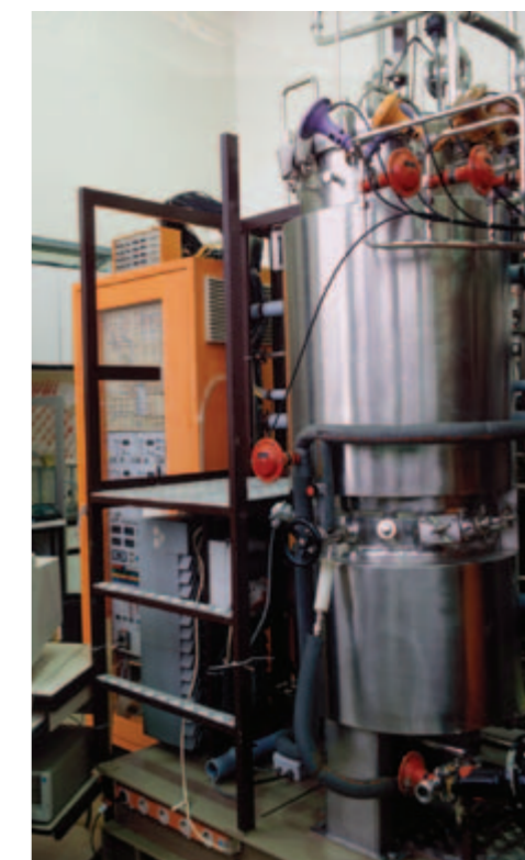
Modern bioreactors permit the sustainable production of basic and fine chemicals.

The majority of all microbial natural products is generated by only few different enzyme families. Examples for such enzymes are polyketide synthases (erythromycin, avermectins, doxorubicin) and nonribosomal peptide synthetases ( \beta -lactam antibiotics, vancomycin, daptomycin). Library screens based on sequence similarities to such enzymes could therefore lead to the targeted isolation of genes belonging to specific natural product classes. This strategy is particularly promising for metagenomic DNA from invertebrate drug sources, since these are often associated with numerous bacteria. In marine sponges, bacteria can represent up to 40% of the total biomass. These animals can therefore be regarded as "microbial fermenters" with an untapped genetic and biotechnological potential. Invertebrate animals often contain promising drug candidates that are of suspected bacterial origin. Cloning and expressing their biosynthetic genes in a culturable bacterium could therefore result in sustainable production methods,