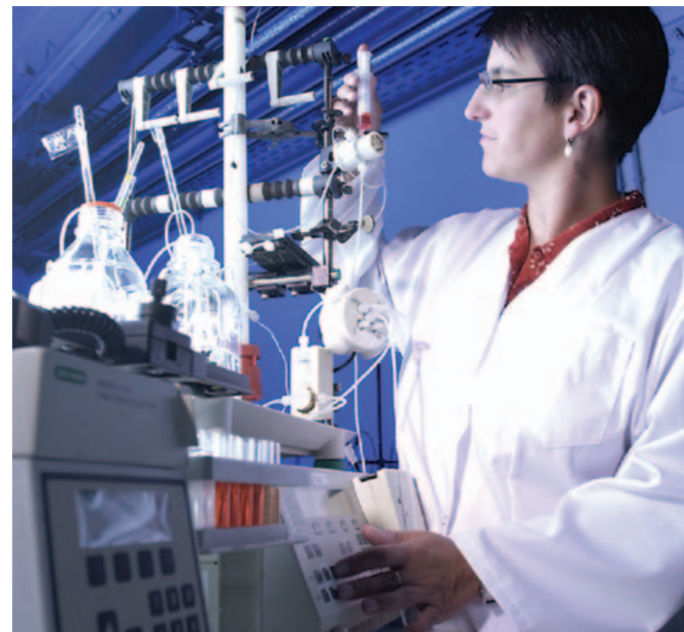
Screening for new functions or compounds as basis for new process developments.